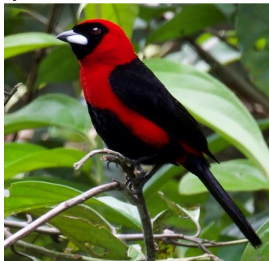
Masked Crimson Tanager

Finally, many people harbor misgivings about visiting the Amazon, fearing excessive heat and humidity, torrential rain, hordes of mosquitoes or other insects. While it is indeed possible to experience such things, most visitors are pleasantly surprised at how comfortable travel can be even in the heart of Amazonia.