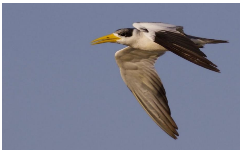
Large-billed Tern

January 24, Day 3: Lima to Iquitos, Peru. Embarkation. Our flight to Iquitos is currently scheduled for a morning departure from Lima and our activities once we reach Iquitos will depend, in large part, upon the amount of time we have available. If our flight is early there may be some time available for birding along the promenade and/or a short drive through the food market area of Iquitos before lunch. Our afternoon activities will be determined by when the ship is outfitted and when we will be permitted to board, but we are sure to have some time to get settled in and have a little time for a short outing.