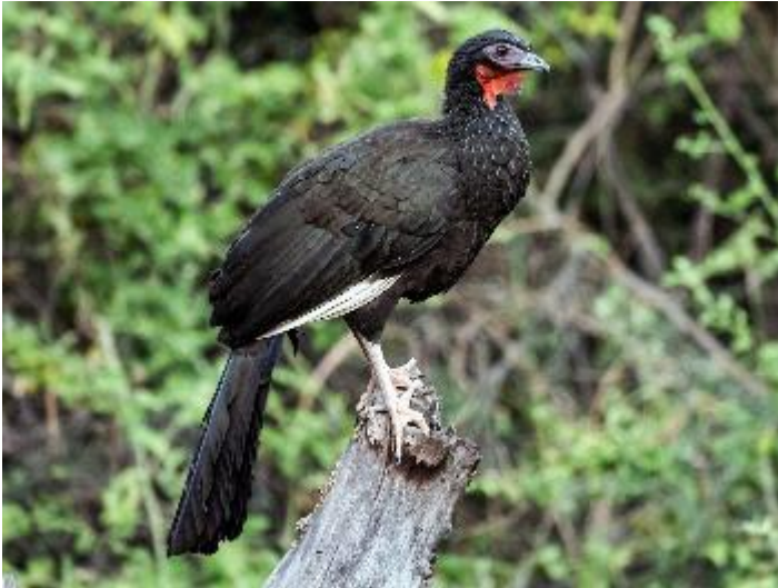
White-winged Guan

January 19, Day 4: Chaparri Ecolodge. This morning after a well-deserved sleep, enjoy a cup of coffee while we indulge our eyes at a small hummingbird pool-party by a running creek just below the outdoor dining room, a great way to start the day! The number of species vary seasonally and based on weather conditions, with less species on overcast mornings. This oasis is visited frequently by Amazilia and Tumbes