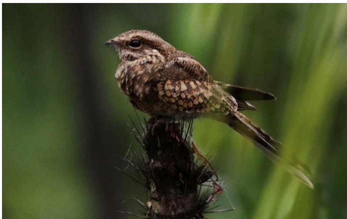
Ladder-tailed Nightjar

January 30, Day 9: Yarapa and San José de Paranapura / Iquitos creek. We will be spending the morning