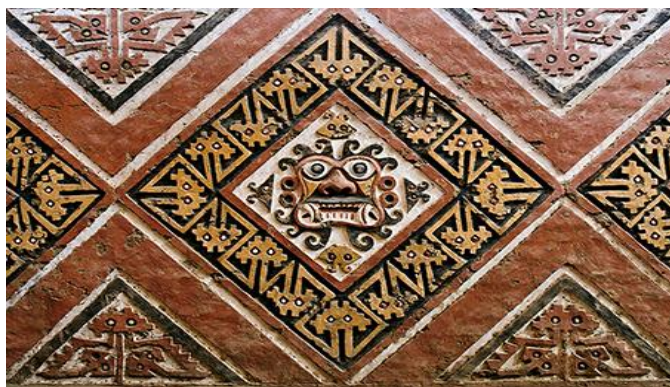
Temple of the Sun and Moon

This afternoon we'll have a special lunch featuring a show of Peruvian Paso Horses and the Peruvian Marinera dance. The Peruvian Paso Horse, known for its smooth lateral gait and even temperament, was first developed in Trujillo from the horses brought over by the Spanish conquistadors. This much respected breed has earned worldwide recognition and has even been declared part of the cultural heritage of the nation. The Peruvian Marinera is a popular courtship dance. Quite graceful, romantic, and elegant, the dance is a mix of Spanish contradanza and Andean zamacueca.