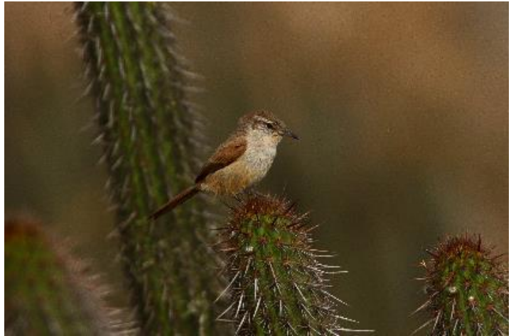
Cactus Canastero

January 22, Day 7: Trujillo and Lomas de Campana to Lima. On our last morning, we will visit a nearby and newly created private reserve known as Lomas Cerro de Campana (45 mins drive from Trujillo). The main objective of this reserve is to protect the delicate coastal hills and lomas ecosystems with its unique flora and fauna. The vegetation develops on the slopes facing the sea, favoring the condensations of mists brought by winds from the south and southwest. These slopes can start at sea level and reach up to 3,200 ft. Above this height the influence of the fog ceases due the phenomenon of thermal inversion. These ecosystems are periodic phytogeographic units that generally contain large numbers of endemism, this probably being the result of geographical isolation since these plant formations function as islands separated by hyper-arid habitat devoid of plant life. These are very special plant formations with unique ecosystems in the world and are mainly found on the coast of Perú and in parts of Chile but to a lesser extent.