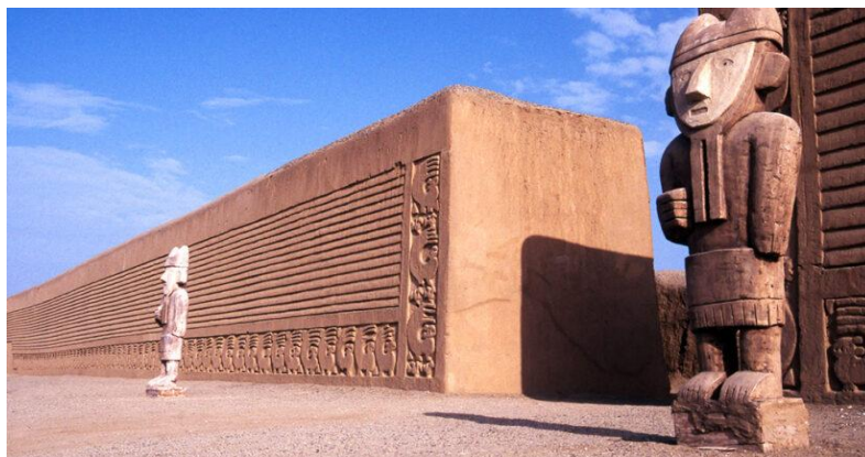
Chan Chan, largest mud city in the world

We'll enjoy a full day exploration of the charming city of Trujillo and it's nearby archaeological wonders beginning with a short walking tour of its historical center visiting the Main Plaza, its Cathedral, and the neoclassical and baroque style mansion homes such as the Urquiaga and Bracamonte. Chan-Chan, the biggest pre-Hispanic urban center built entirely with mud bricks is located only three miles northeast of the city and was declared a World Heritage Site by UNESCO back in 1986. This amazing complex features plazas, workshops, streets, walls and pyramidal temples. Its enormous walls are profusely decorated with reliefs of geometric figures, zoomorphic stylizations and mythological creatures.