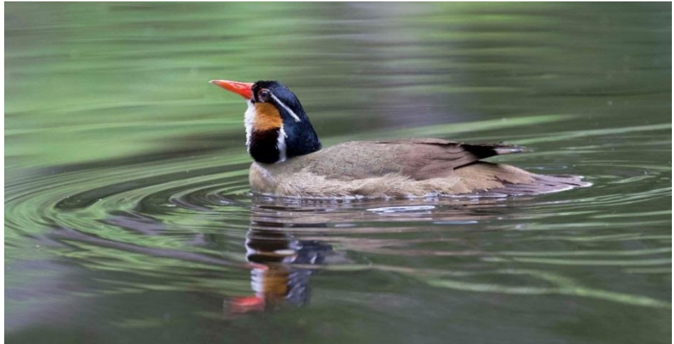
Sungrebe (singing)

Late morning will find us back aboard our ship as we prepare to retrace our route back down the Río Ucayali. We will reposition ourselves downriver near the junction of the Marañon and weigh anchor for the evening. Time permitted we will make a short excursion by boat to a nearby river island or stream.