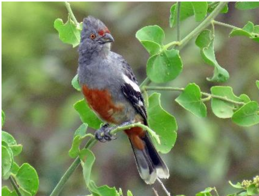
Peruvian Plantcutter

The archaeological wonders of northern Perú offer a unique opportunity to look into Peru's earliest complex societies. Traveling the territory of the former Moche and Chimu kingdoms will truly be an epic adventure. Stretching from modern day Chiclayo to Trujillo, the Pacific-hugging landscape where the cold nutrient rich waters of the northern end of the Humboldt Current mixes with the warmer waters flowing south creating a wealth of marine life, the perfect setting for the flourishing of these cultures.