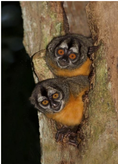
Night Monkeys

On our second day, as we continue exploring up the Río Ucayali, we will encounter an increasing number of black water rivers and lakes such as Yanallpa creek. On past trips we have recorded Wattled Curassow, Crested Eagle, Tiny Hawk, Collared Forest-Falcon and other large birds, and their presence suggests that the wildlife here is not persecuted. Even if we do not find any of these species (all rare), we are sure to find many other interesting birds. During mid-day and early afternoon, we will reposition the ship again, moving further upriver, perhaps as far as the mouth of Zapote Creek. A small native community is located a short distance up the Zapote and the area beyond their village is designated as a reserve where they do not hunt. Consequently, this area also is particularly good for primates, raptors and other large birds. If we reach Zapote Creek, we'll depart in our skiffs for a late afternoon excursion up this beautiful stream, with the possibility of remaining out until after dark, before returning for dinner. On these evening excursions, we often see Common or Great potoos, and sometimes a Tropical Screech-Owl, or Common Pauraque or Ladder-tailed Nightjar, but there also is the possibility of finding frogs, a small caiman, various kinds of insects, and