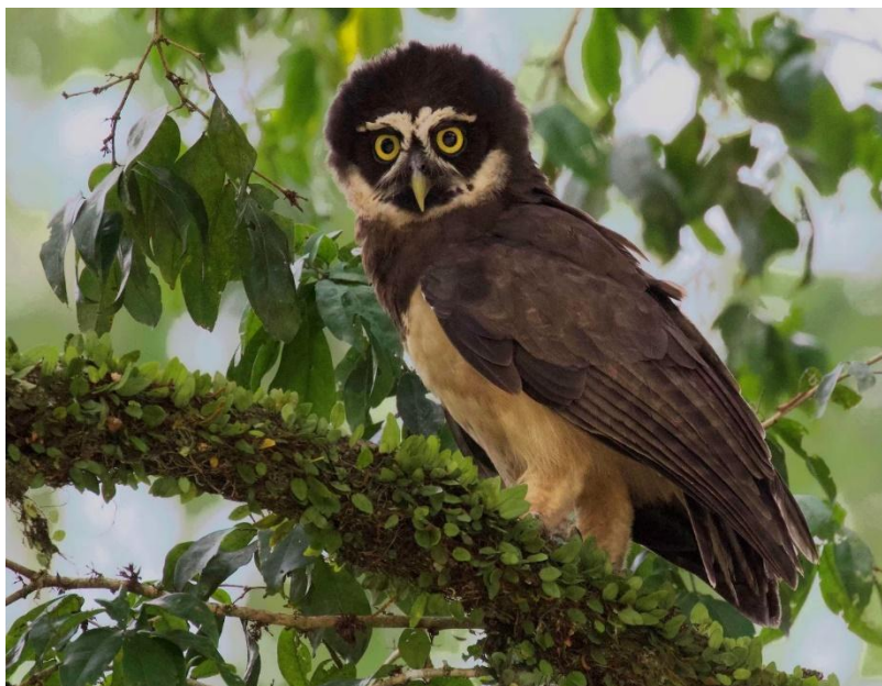
Spectacled Owl

River islands are also used by forest or migrant species to roost, such as Short-tailed Parrot; Tui and White-winged Oarakeets; Yellow-rumped Cacique, Eastern Kingbird and Barn Swallows. But the importance to preserve this habitat is due to the fact that other species make their entire life there, including Olive-spotted Hummingbird; Lesser Hornero (sand bars); White-bellied, Parker's and Castelnau's Antshrike (mainly older islands); Red-and-white spinetails; Leaden Antwren; Black-and-white Antbird; Brownish Elaenia; River Tyrannulet; Lesser Wagtail-Tyrant; Riverside Tyrant; and Pearly-breasted Conebill. Other species we could see on or in the vicinity of river islands include Lesser Yellow-headed Vulture; Wattled Jacana; Greater and