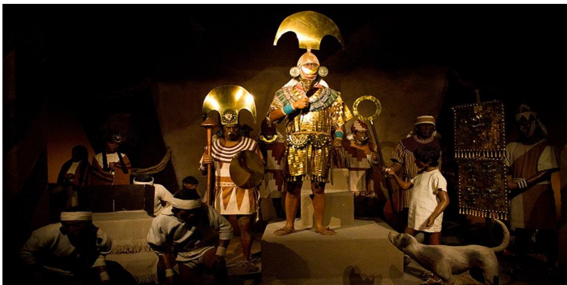
Royal Tombs of the Lord of Sipan

January 17, Day 2: Lima to Chiclayo. Morning flight to the northern coastal city of Chiclayo. Upon arrival, a short 30-minute drive takes us to the Eten Port for our first taste of Peruvian water birds, this fine coastal marsh offers great opportunities for various species of teals, egrets and herons, the handsome Many-colored Rush-tyrant, Least Seedsnipe and sometimes Tawny-throated Dotterel. Many seabirds typical of the cold, rich waters of the Humboldt Current occur just offshore. These include Peruvian Pelicans and Boobies, Neotropical Cormorants, Band-tailed, Gray-hooded and Kelp Gulls and Peruvian Terns. We should be at the hotel for lunch and respective check-in.